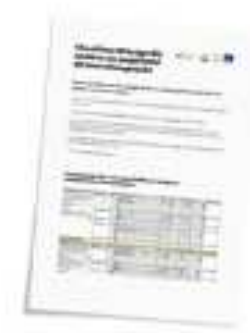
Checklista till budget