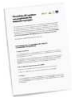
Checklista till ansökan om projektstöd