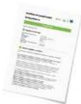
Ansökan om projektstöd