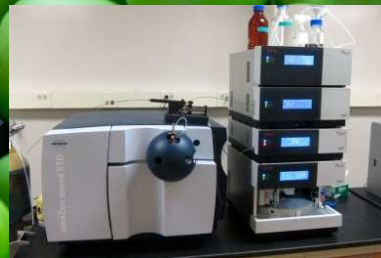
Biochemical analysis of proteins