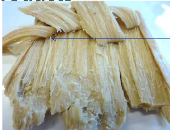
Strukturerat protein erhålet via extrudering